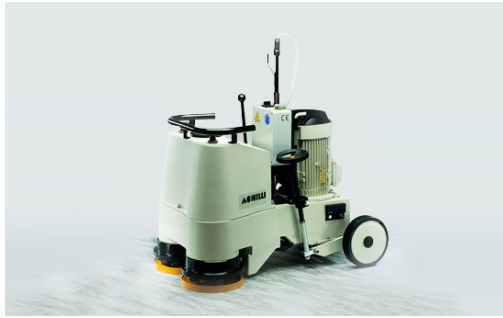
2 heads floor grinder MAX BT