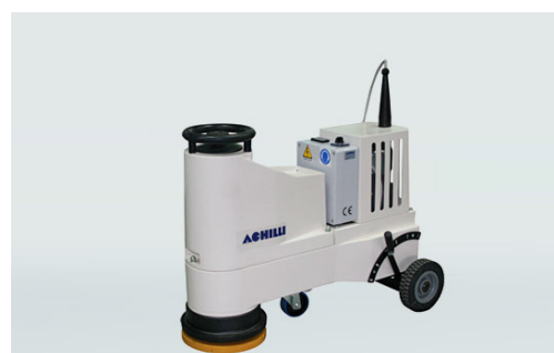
Marble 1-phase floor grinder LM30-CE