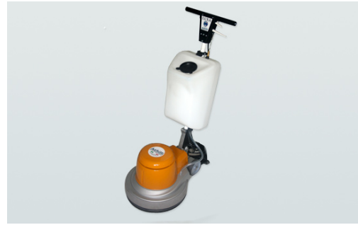
LUXA universal floor polisher