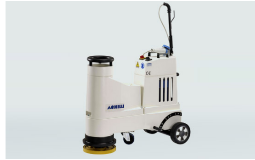
Universal 1-phase floor grinder LM30-VE