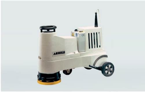
Marble 3-phase floor grinder MEC7-CE