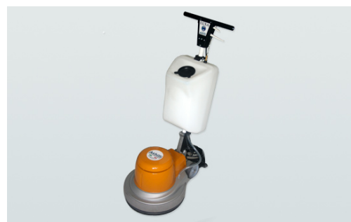
LUXA universal floor polisher