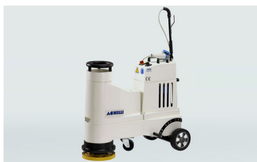
Universal 1-phase floor grinder LM30-VE