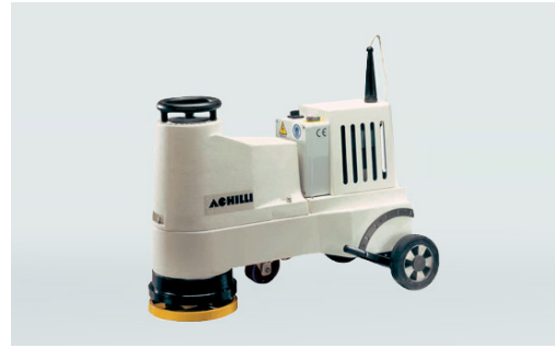
Marble 3-phase floor grinder MEC7-CE