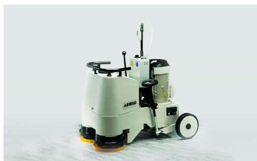
2 heads floor grinder MAX BT