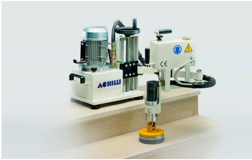
Hydraulic step grinding LS40