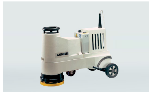
Marble 3-phase floor grinder MEC7-CE