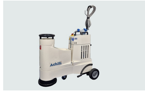
Universal 1-phase floor grinder LM30-VE