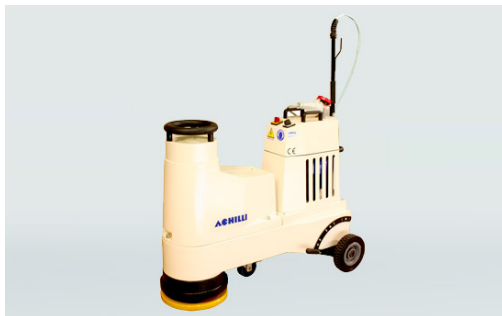
Universal floor grinder MEC7-VE