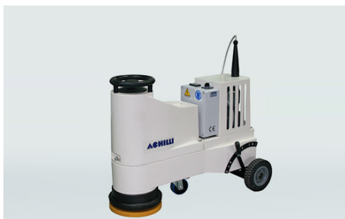
Marble 1-phase floor grinder LM30-CE