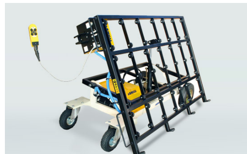
Slab trolley SC500 and SC800