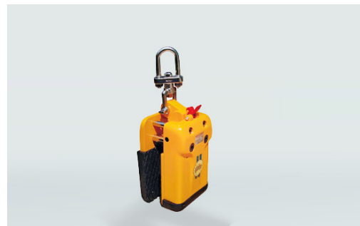
ABACO Little Giant slab lifter