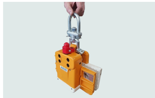
Sky Rider slab lifter