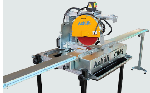
Wet cut sliding compound miter saw CMS