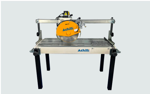
Portable bench saw AMS