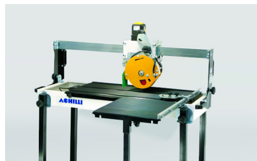
Tile saw ATS