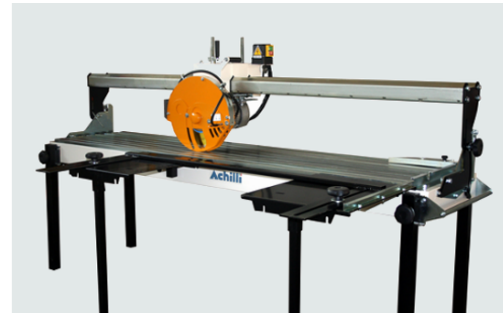
Cutting and profiling machine ANR