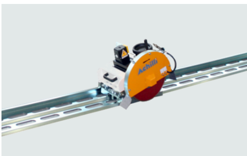
Track saw on mobile rail TSA