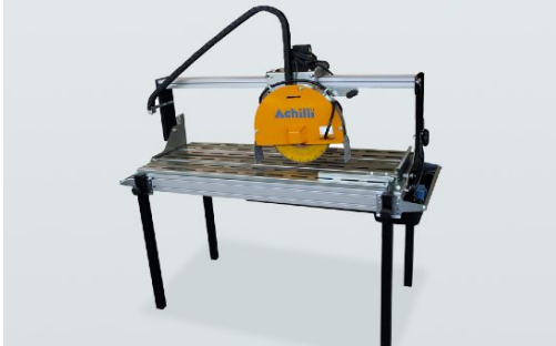
Aluminum bench saw ALU