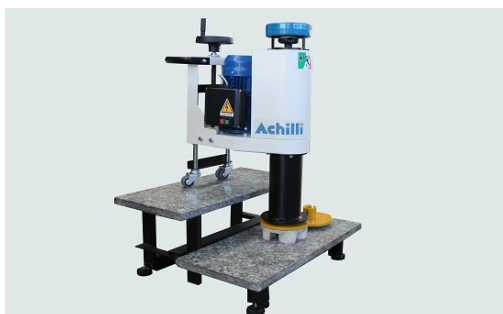
STEP grinding machine for stairs