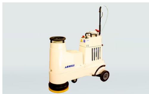
Universal floor grinder MEC7-VE