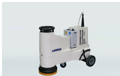
Marble 1-phase floor grinder LM30-CE