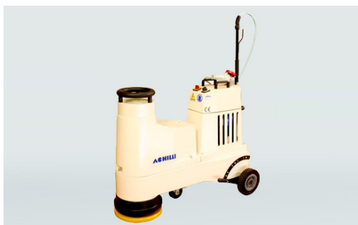
Universal floor grinder MEC7-VE

Three phase floor grinder with two heads, ideal for large surfaces