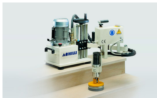
Hydraulic step grinding LS40