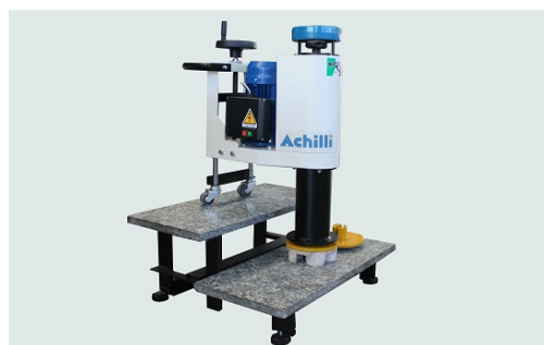
STEP grinding machine for stairs